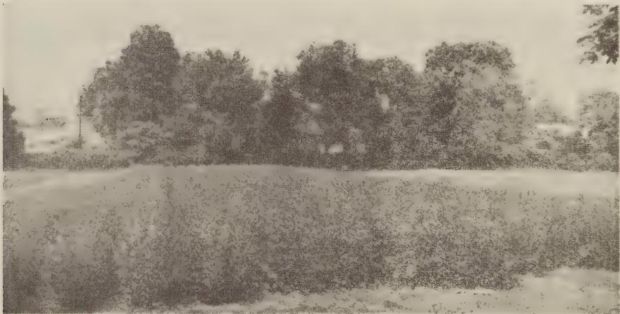
Block of our well filled two year Amur River Privet.

Due to shortage in storage space we will be able to quote attractive row run prices, late Fall delivery, at your request. A good buy for those who are prepared to store and grade this Winter for Spring sales.